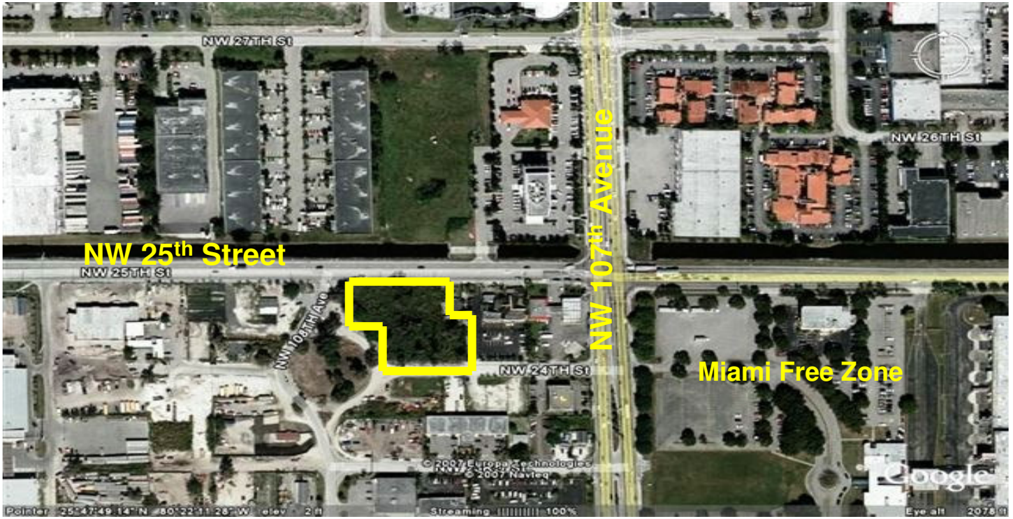
Site Survey Map